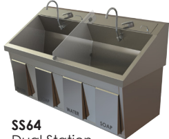
SS64 Dual Station