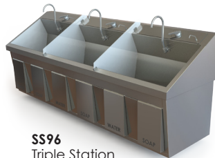
SS96 Triple Station

For more information, or to place an order, contact our customer service department at 618-476-3550 or 877-828-9975 , or by email at sales@macmedical.com .