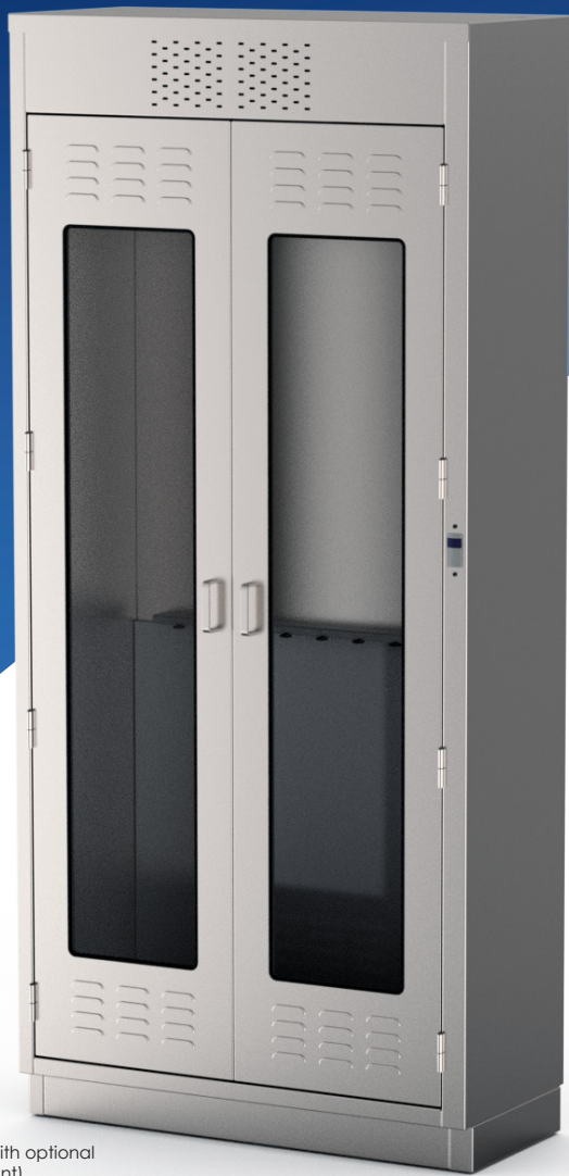
IC184292 (shown with optional power vent)

Efficient drying and storage for multiple endoscopes