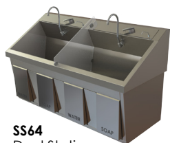
SS64 Dual Station