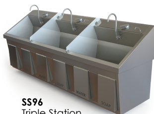
SS96 Triple Station

For more information, or to place an order, contact our customer service department at 618-476-3550 or 877-828-9975 , or by email at sales@macmedical.com .