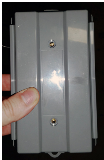
Exterior of battery pack

MAC Medical, Inc. Printed in USA Publication No. IFU-054 Rev A December 2015