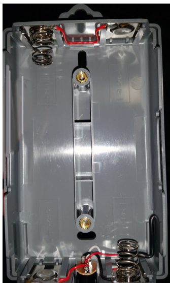
Interior of battery pack