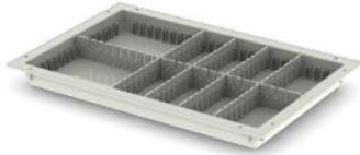
5cm TRAY - MMT054060 SHORT DIVIDER - MMDO540 LONG DIVIDER - MMDO560