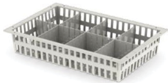
10cm BASKET - MMB104060 SHORT DIVIDER - MMD1040 LONG DIVIDER - MMD1060