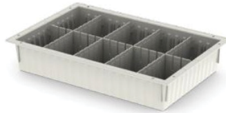
10cm TRAY - MMT104060 SHORT DIVIDER - MMD1040 LONG DIVIDER - MMD1060