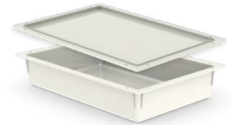
10cm TRAY - MMT104060ND (NOT DIVIDABLE) * LID - L4060