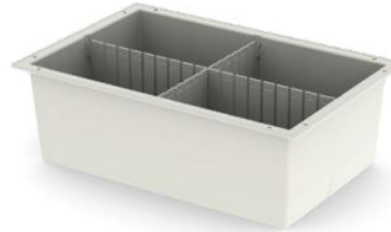
20cm TRAY - MMT204060 SHORT DIVIDER - MMD2040 LONG DIVIDER - MMD2060