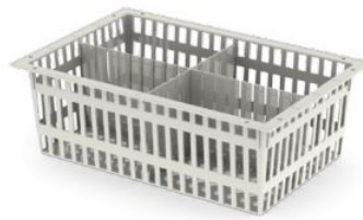
20cm BASKET - MMB204060 SHORT DIVIDER - MMD2040 LONG DIVIDER - MMD2060