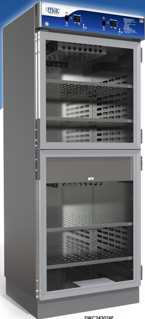
DWC243074E (shown with optional glass doors)

The D-Series (Data Logging) Blanket & Fluid Warming Cabinets provide independent, digitally controlled heating chambers that offer actual temperature and set point displays. Data is recorded every 30 minutes and stored for up to two years. Choose from single, dual, or triple chamber units.