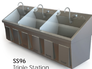
SS96 Triple Station

For more information, or to place an order, contact our customer service department at 618-476-3550 or 877-828-9975 , or by email at sales@macmedical.com .