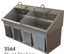
SS64 Dual Station