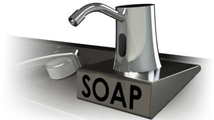
Optional Infrared Soap Dispenser