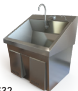
SS32 Single Station