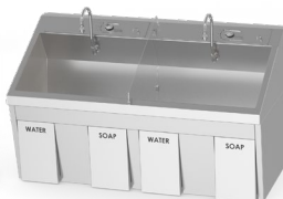
SS64 Dual Station