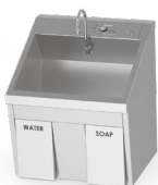
SS32 Single Station