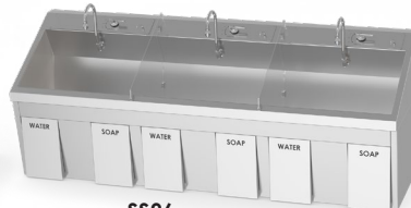
SS96 Triple Station

For more information, or to place an order, contact our customer service department at 618-476-3550 or 877-828-9975 , or by email at sales@macmedical.com .