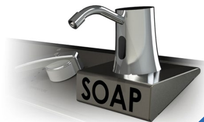
Optional Infrared Soap Dispenser