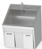
SS32 Single Station