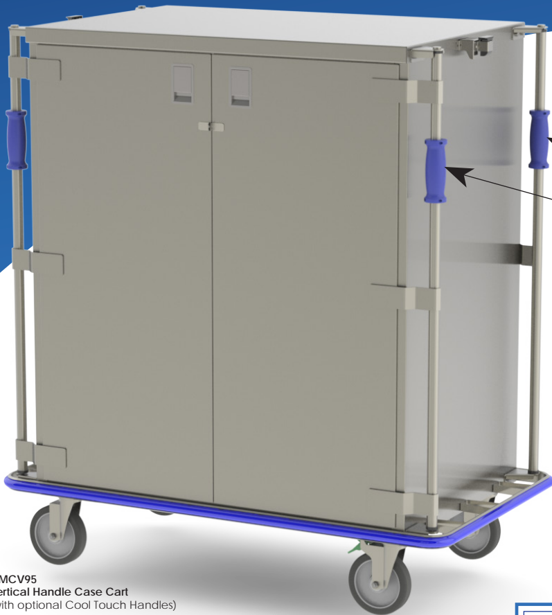
MMCV95 Vertical Handle Case Cart (with optional Cool Touch Handles)