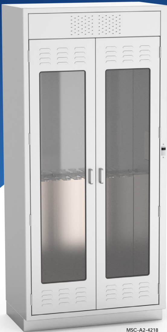
MSC-A2-4218 (shown with optional power vent)

Efficient drying and storage for multiple endoscopes