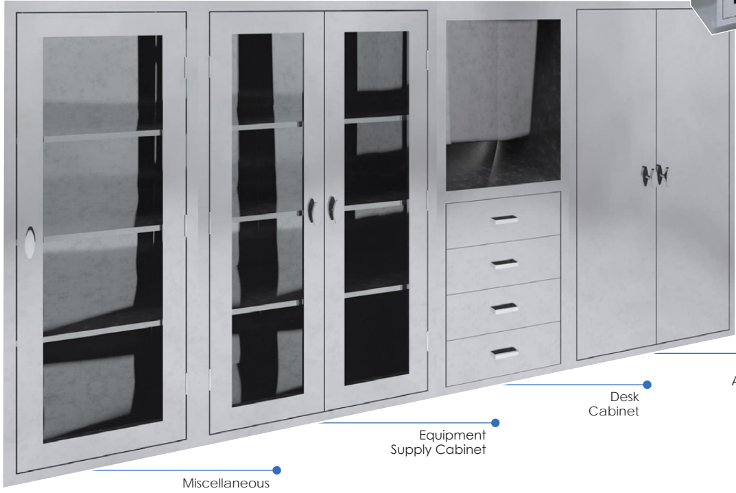
Miscellaneous Supply Cabinet