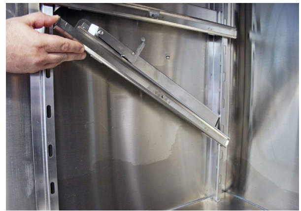
Fig. 8: Tilt Rail Up

Tilt the rail up and pull forward (Fig. 8).