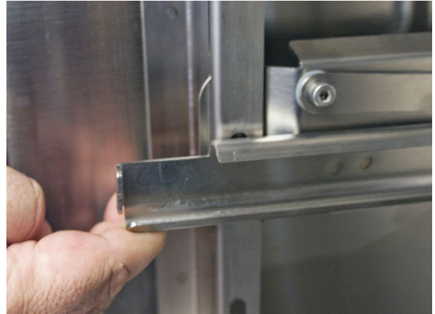
Fig. 6: Lift Rail Up

Press the button to release the rail (both sides of the cabinet) so that the rails can be moved to another level (Fig. 5).