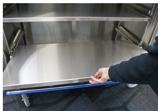
Fig. 4: Pull Out Shelf