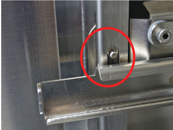
Fig. 5: Press Release Button

To adjust the shelf level, first remove the shelf as detailed on Page 1 (Figs. 3 - 4) - Removing Roll Out Shelves .