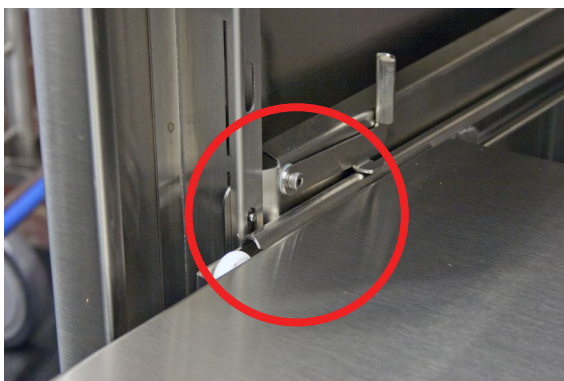
Fig. 3: Pull Shelf Till First Two Rollers Visible

To remove a roll out shelf (solid, perforated or wire), pull the shelf out along its glide until the first two rollers are visible (Fig. 3, circled in red). Then tilt up the shelf to free the first two rollers from the rail and continue to slide out until the second set of rollers are visible. Then lift out the shelf (Fig. 4).