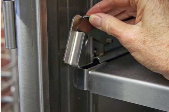
Fig. 1: Rotate Shelf Latch

The shelves can be locked into place in the unit with the shelf latches.