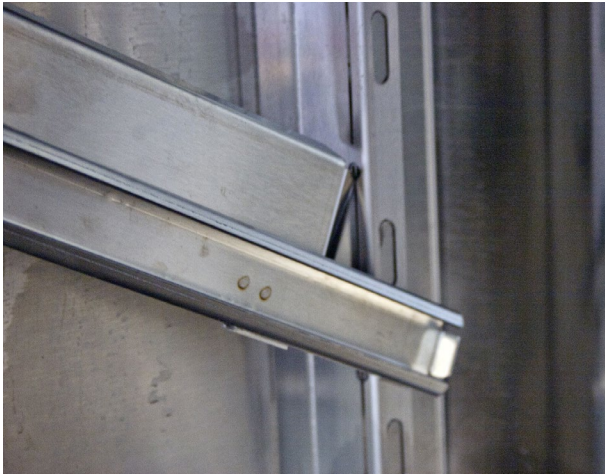
Fig. 9: Set Rail in New Position

To set the rail in its new position, align the rail at an angle with the rail slots at the back of the cart (Fig. 9).