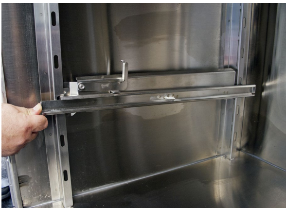
Fig. 7: Push Rail Toward Back

Lift the rail up so that the pin disconnects from the slotted vertical side rail (Fig. 6).